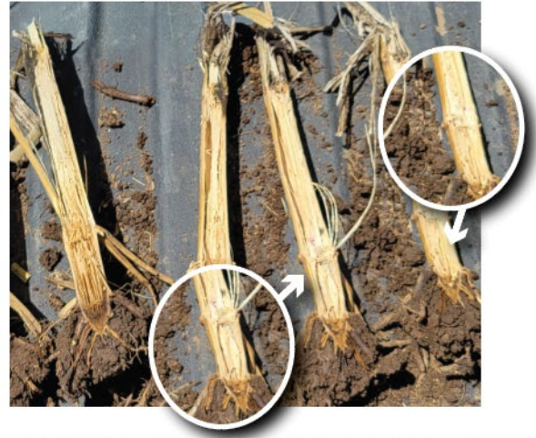
COMPETITOR WITH WATER

In our Redstar RX test plots, we looked at the difference in the amount of residue and nutrients tied up in the residue with prominent residue degrader products. While visual representation is great, we measured all of the trials residue to get hard numbers.