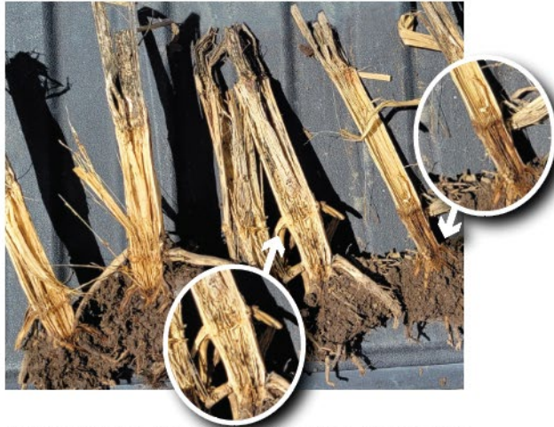
BREAKDOWN WITH WATER